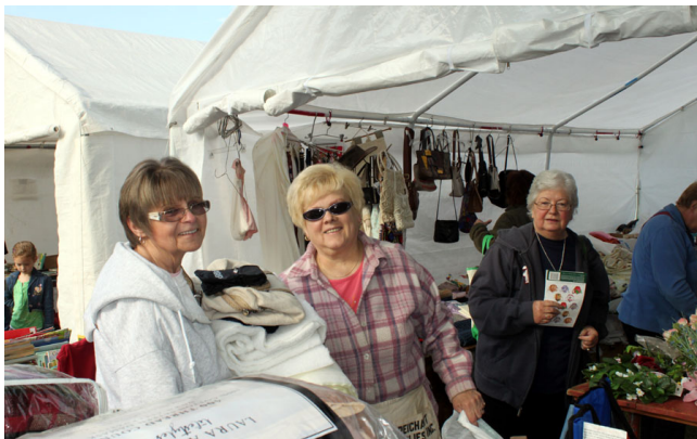
Shoppers, shoppers everywhere.