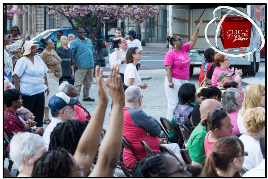
Crowds gathered on Public Square in Wilkes-Barre on Thursday, May 7<sup>th</sup> for the National Day of Prayer and Circle the Square with Prayer.