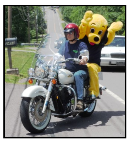
WRGN Ride for Radio Saturday, July 11<sup>th</sup>

Join us Saturday June 6th for WRGN's MORE Than A Yard Sale!