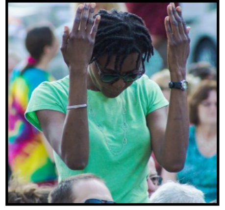
National Day of Prayer was declared an annual event in 1952 by a joint resolution of Congress, signed by President Truman.