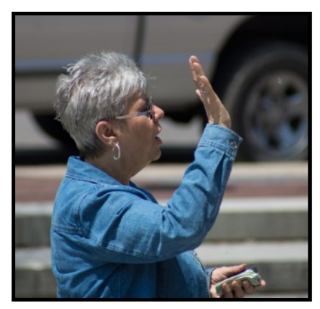
Prayer time, broadcast live on WRGN, focused on those in leadership in all levels of government, church, and educational areas of influence.