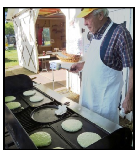
"Breakfast is Served" at WRGN's More Than a Yard Sale Saturday, June 6<sup>th</sup>

Household items, a book tent, a craft and material tent, a holiday tent filled with decorations for use throughout the entire year, a children's toy tent, a baked goods stand, homemade ice cream, and a food booth serving both breakfast and lunch. If you are looking for it, it can probably be found at the WRGN More Than a Yard Sale on Saturday, June 6 at the Saxe Homestead, 211 Bethel Hill Road, Sweet Valley.