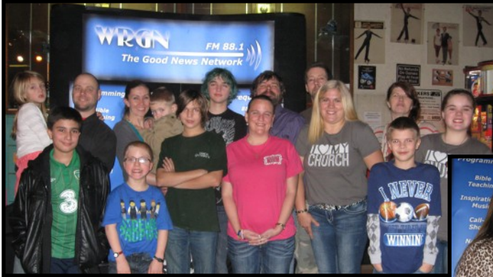
Mt. Zion Baptist Church