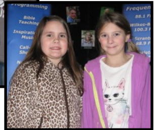
WRGN Skate ticket winners