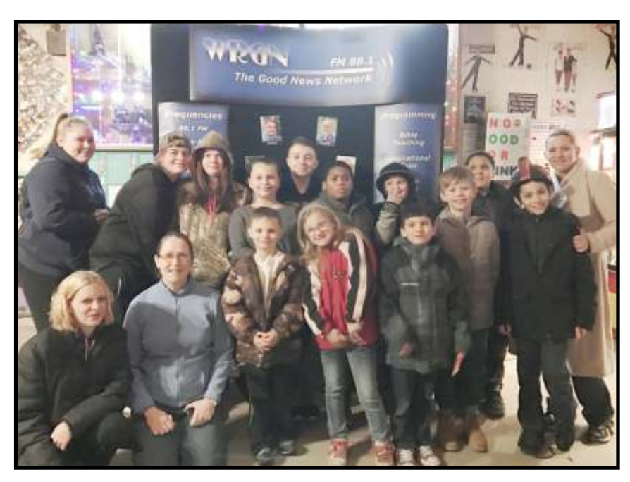
Central United Methodist Church, Wilkes-Barre