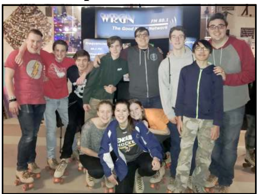
Back Mountain Harvest Assembly, Trucksville