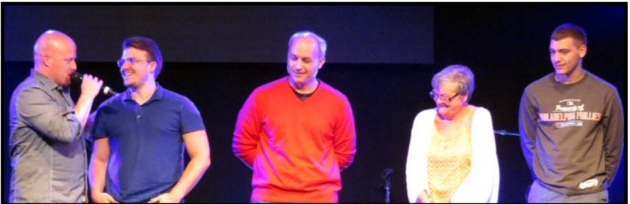
Selah brought some fans on stage to help out with one song!