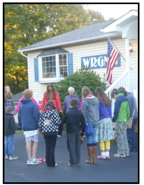
A group of homeschool students asked to use WRGN's flag, and 600 students reported in on SYATP Live!