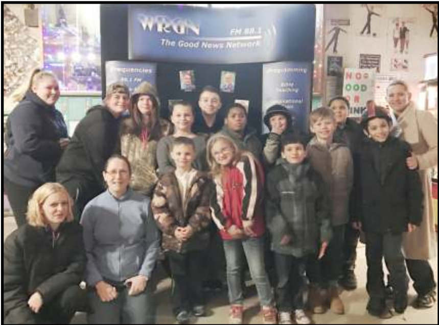
Central United Methodist Church, Wilkes-Barre