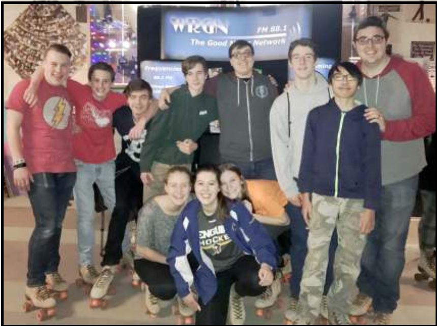
Back Mountain Harvest Assembly, Trucksville